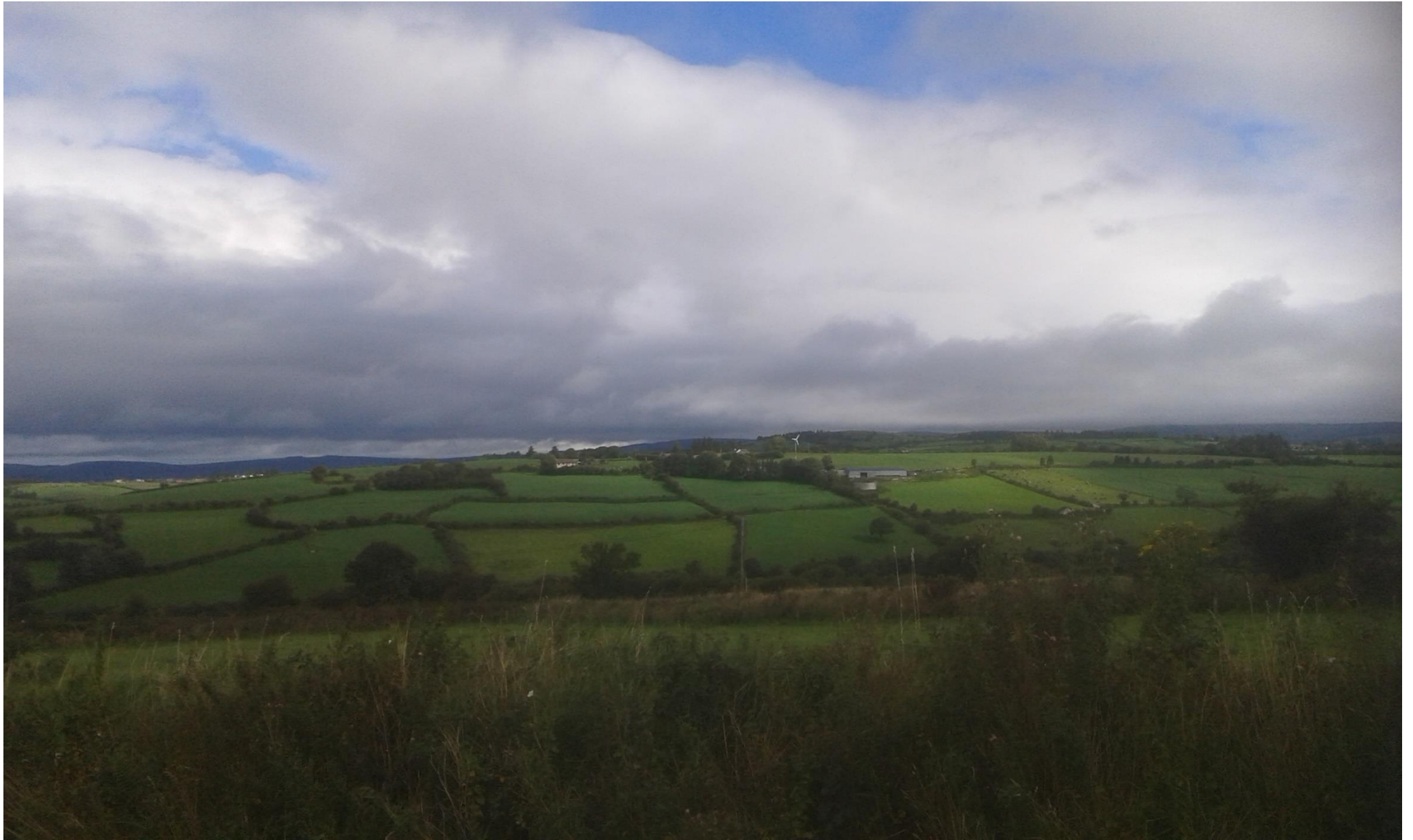
Clear View from Kilsarcon Cemetery across the valley to Dromulton Homestead.