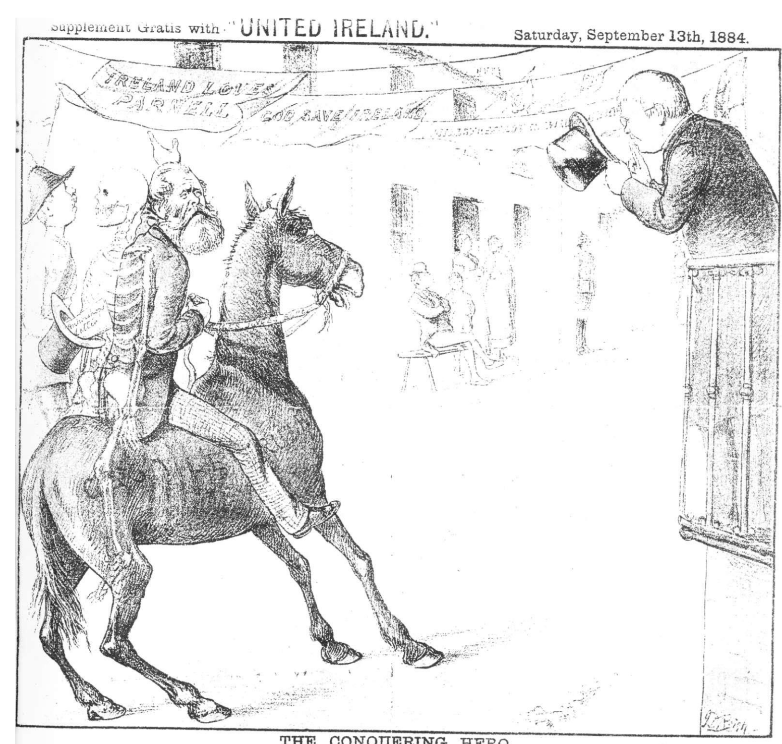
THE CONQUERING HERO. CONQUERING HERO—Hulle, Canon, this is not part of your arrangements, eh? CANON—The decorations are not—ahem!—altogether what might be desired, but your Ex——y will find the luncheon excellent.