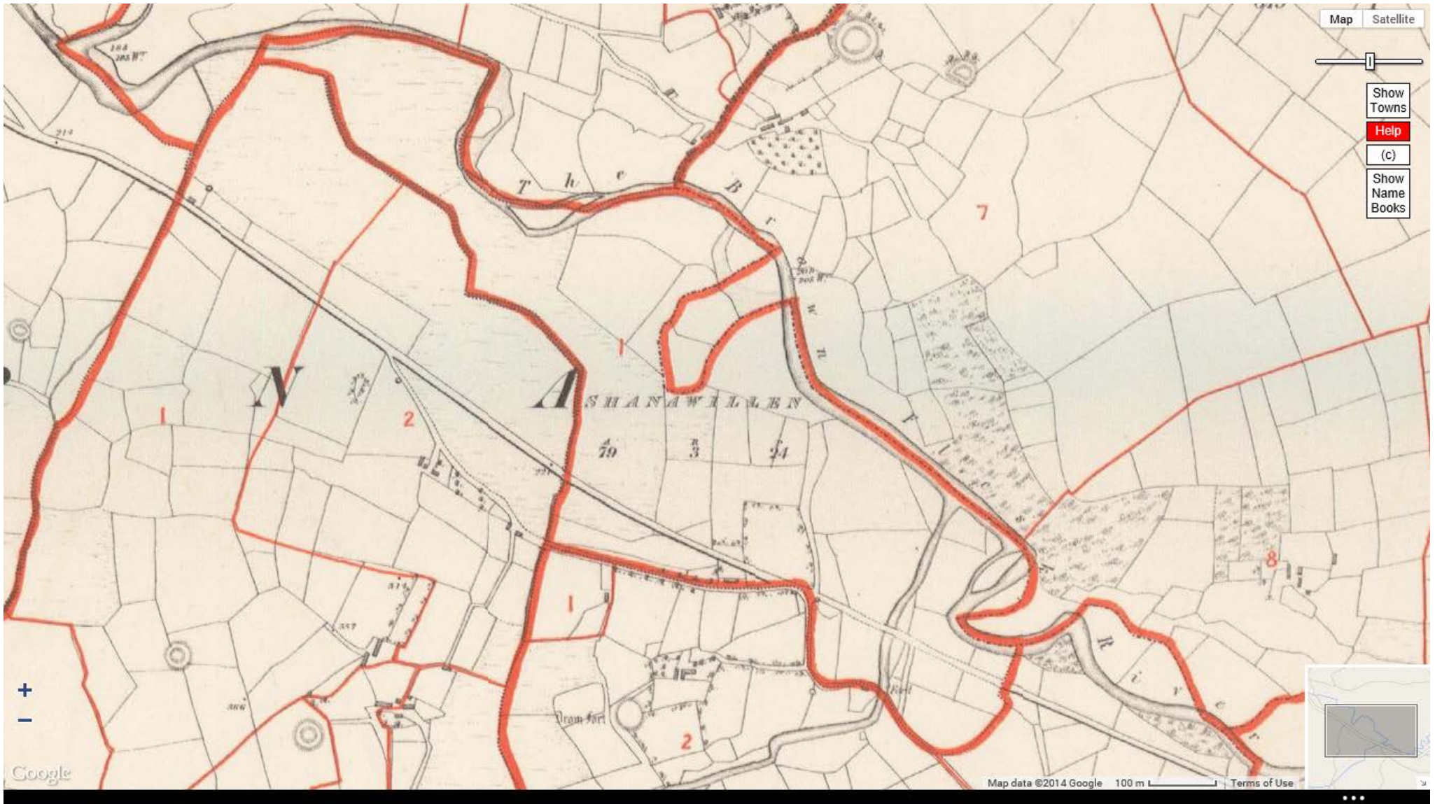
GV Maps for Shanawillen